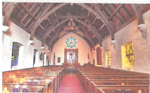
Union Church of Pocantico Hills